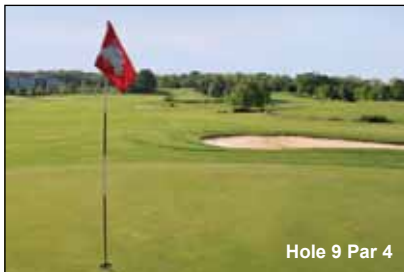
Hole 9 Par 4

I felt that the course played a bit longer than the advertised yardages because you face many uphill approach shots. Right out of the gate, you have one at the first hole. Since the fairway is wider than it looks from the tee, favor the right side to avoid the water. The par 3 second is remembered for the red barn/maintenance building that serves as the backdrop. You will find most of the trouble to the right on the par 5 third.