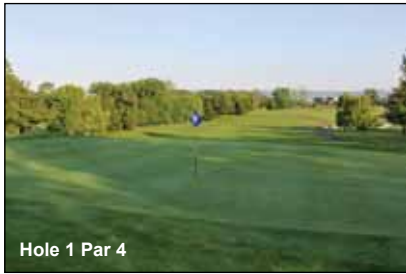
Hole 1 Par 4

Staying at the top doesn't always come easy. Professional athletes and teams strive for it each season. For a golf course to stay at the pinnacle, it requires an incredible amount of consistency, which is rather difficult to obtain when you think about all the intricacies that go into putting out a great product year after year. So, for a golf course to be voted head of the class 17 out of 20 years, that would be something, wouldn't it? Well, Clustered Spires Golf Club in Frederick Maryland did just that being voted as "Best of Frederick" golf course by readers of Frederick Magazine . Clustered Spires took the honor again this year with a whole lot of heavy competition in the area.