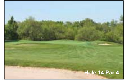
Hole 14 Par 4

The back side opens with a par 5 that normally requires three shots for most mortals. Several distinctive par 4s highlight this nine starting with the eleventh. Ponds border both sides of the fairway and a deep pot bunker sits right in the middle of the green's entrance. A testy dogleg right par 4 follows. Thirteen, the shortest par 3 on the course, plays to a hefty green surrounded by three traps. Encounter another par 4 at fourteen before traversing a terrific set of closing holes. Enjoy the sounds of the flowing river adjacent to the fifteenth, the only blind tee shot on the course. Navigate your second shot on this wonderful par 5 between the bunkers and trees for your best approach to a kidney shaped green. Sixteen, the last of the 3 pars and also the longest at over 200 yards, plays from an elevated tee. Two par 4s, the postcard-worthy seventeenth and the daunting 470-yard finisher, wrap things up.